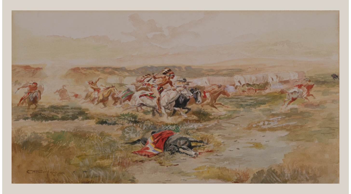
Breaking Up the Ring, 1900, Charles M. Russell, Oil on Canvas Sid Richardson Museum, Fort Worth, Texas